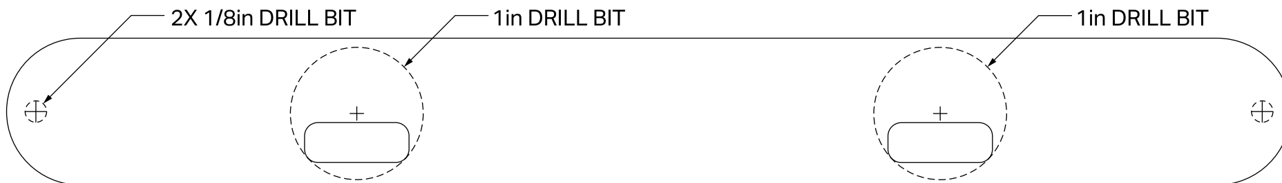
Flat Wide Surface Mount